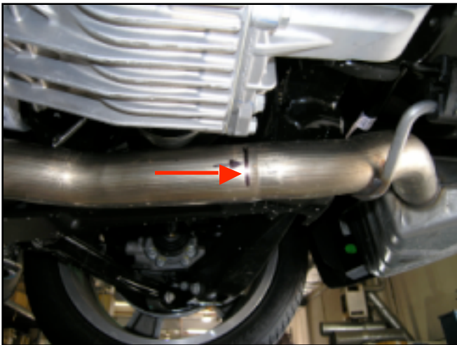
Passenger side pipe cutting location