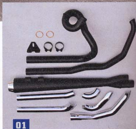
01 A shot of the whole system laid out showing all of the detailed hardware that is in the kit as well as the heat shields.

We gave Darryl and the crew a call with our requests and dragged our project FLHX over to Bassani's world headquarters located in Anaheim, California, to get a set mounted up. The install was a breeze, with the parts all fitting like they should, and it took less time to remove and replace than mowing and edging my lawn. On my first ride with the Road Rage system installed, it was evident with my trusty butt dyno that more torque was unlocked from the Street Glide's motor and the sound produced was pure Bassani—not too loud at idle and an awesome throaty rumble when working through the gears. As far as the looks of the pipes when installed go, they have just enough black for a person going the blackout route and just enough shine for the chrome junkies. On a scale of 1 to 10, on the two-into-one exhaust systems we've tried, I would give this system a 9, with a 10 being a gold-plated set made by the gods high atop Mount Olympus. B